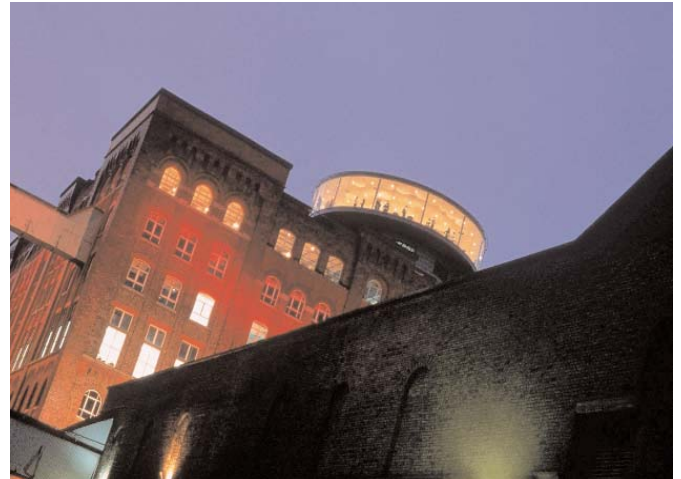
The Guinness Storehouse

Contact science@yakult.ie if you would like more details or a registration form.